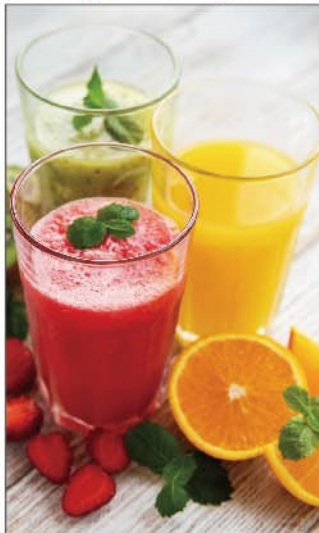
夏日繽紛樂 Summer Drinks Promotion