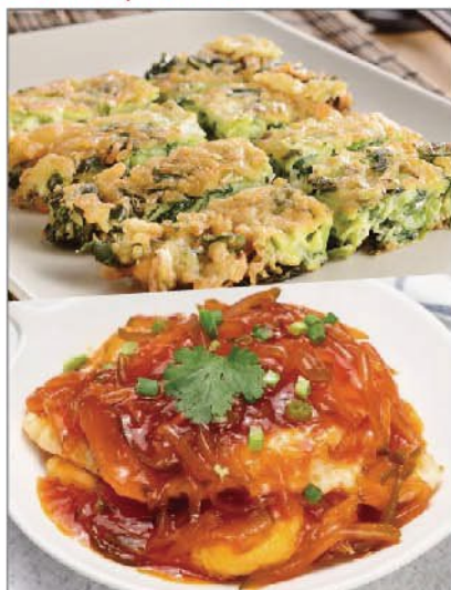
懷舊風味篇 Old Favourite Cuisine

26-27 September (Sat & Sun), 1-2 October (Thu & Fri)