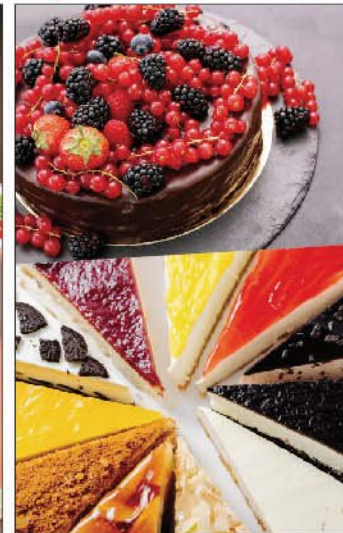
預訂自製蛋糕及切餅優惠 Home-made Fresh Cake and Daily Cut Cake Promotion

Starting from Mon, 20 July - 4 September