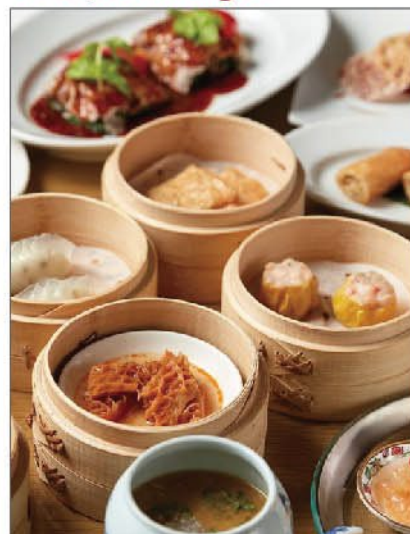
任點任選自助點心推廣 Optional Dim Sum Promotion