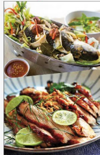
泰式美食巡禮 Thailand Cuisine Promotion