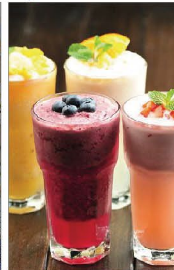
夏日奇冰及仲夏特飲 Summer Cool & Fruit Drink