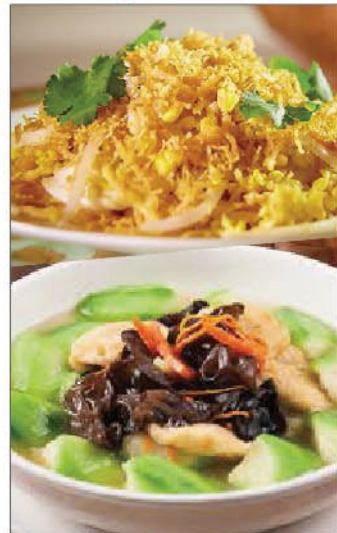
順德風味篇 Shunde Cuisine Delicacies