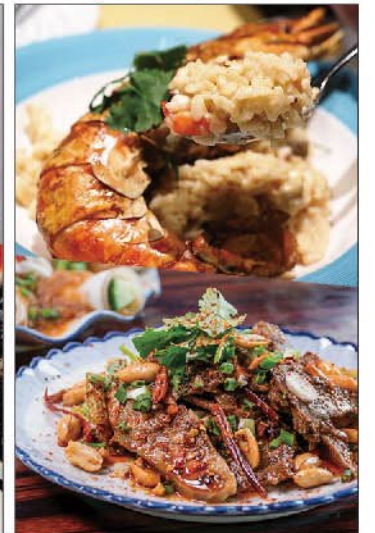
新派酸辣推介 New Style Hot & Sour Cuisine

Starting from Mon, 20 July - 4 September