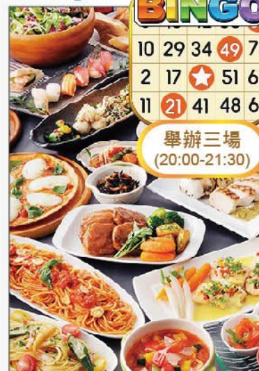
錦綉BINGO之夜自助晚餐 Fairview BINGO Night Dinner Buffet

Starting from Tue, 8 September - 23 October