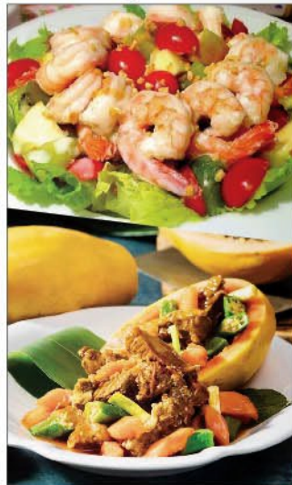
鮮果佳餚薈聚 Seasonal Fruit Delicacies Delight