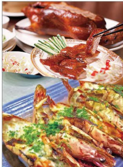
夏日逍遙宴 Summer Special Set Menu