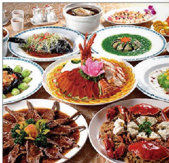
花好月圓套餐及小菜精選 Mid-Autumn Festival Set Dinner & Hot Dish Recommendations

26-27 September (Sat & Sun), 1-2 October (Thu & Fri)