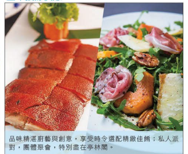
創意酒席(中西合璧) Banquet of Culinary Innovation

All Year Round Advance Order Menu 全年預訂供應