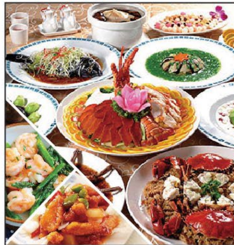
花好月圓套餐及小菜精選 Mid-Autumn Festival Set Dinner & Hot Dish Recommendations