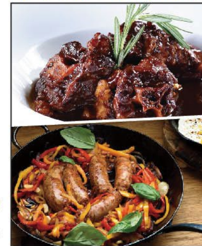
亞洲西式《燴萃》精選 Asian & Western Braised Recipe

Starting from Tuesday, 27 October - 27 November