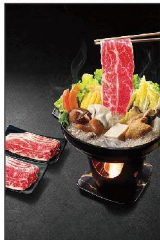
一人一爐自助火窩 Individual Hot Pot Dinner Buffet

Starting from Monday, 19 October - 3 December