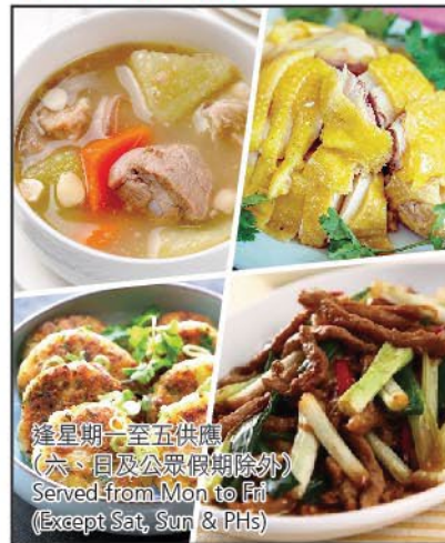
晚上四和菜套餐 Dinner Set Menu