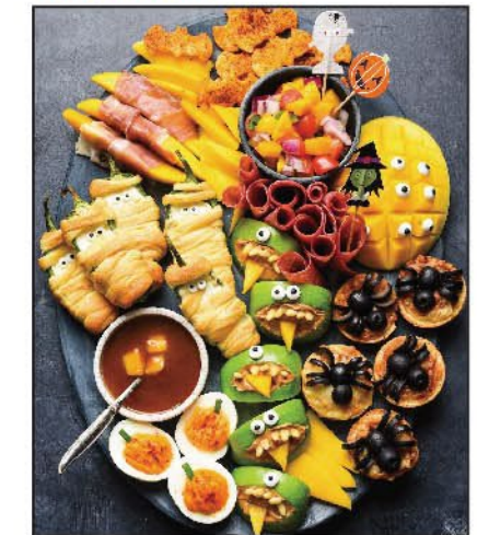
萬聖節半自助晚餐 Halloween Semi-Buffer Dinner