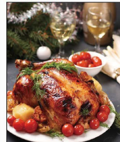
火樹銀花平安夜自助晚餐暨 幸運大抽獎 Christmas Eve Dinner Buffet cum Lucky Draw Night