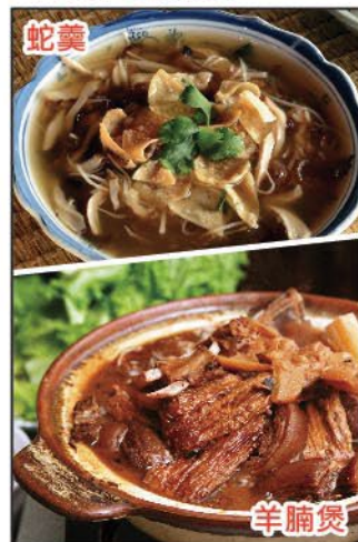
秋冬佳餚篇 Winter Delicacies

Starting from Wednesday, 4 - 30 November