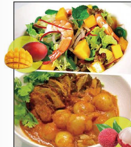
鮮果健康食譜 Healthy Fresh Fruit Delicacies

Starting from Tuesday, 27 October - 27 November