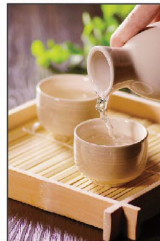
中西佳餚清酒晚會 Chinese, Western Cuisine Sake Tasting Dinner

Starting from Wednesday, 9 - 31 December