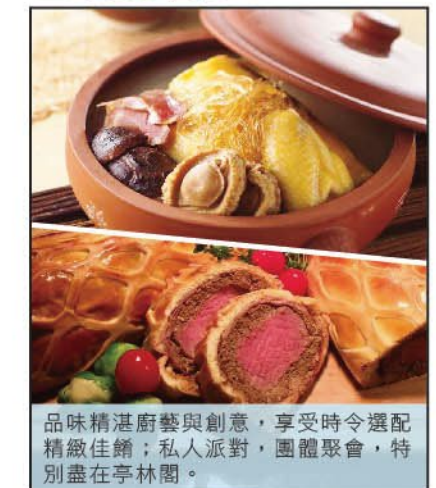
創意酒席(中西合璧) Banquet of Culinary Innovation

All Year Round Advance Order Menu 全年預訂供應