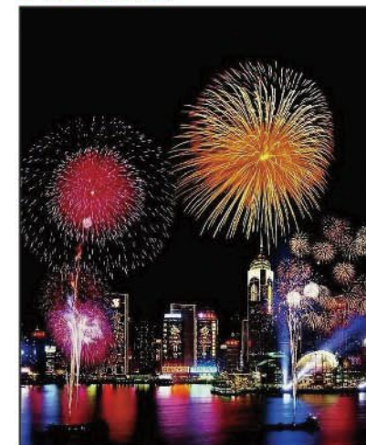
大除夕美食半自助晚餐 New Year Eve Semi-Buffer Dinner

All Year Round Advance Order Menu 全年預訂供應