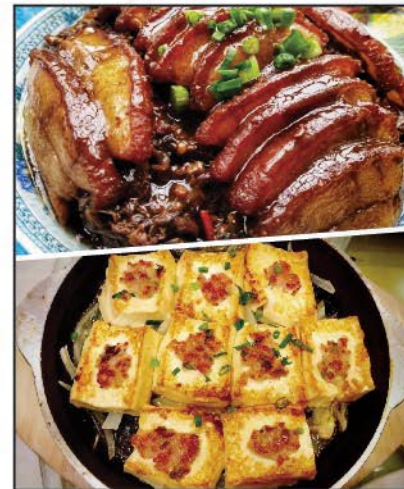
客家美食坊 Hakka Cuisine

Starting from Monday, 19 October - 3 December