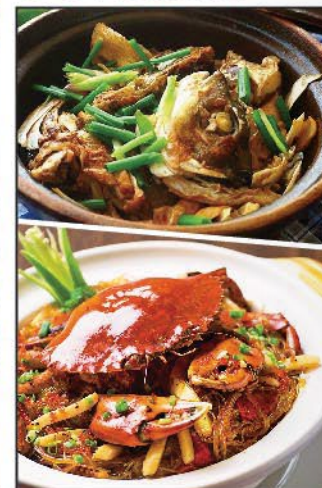
廚師窩燒推介 Casserole Delicacies

Starting from Wednesday, 9 - 31 December