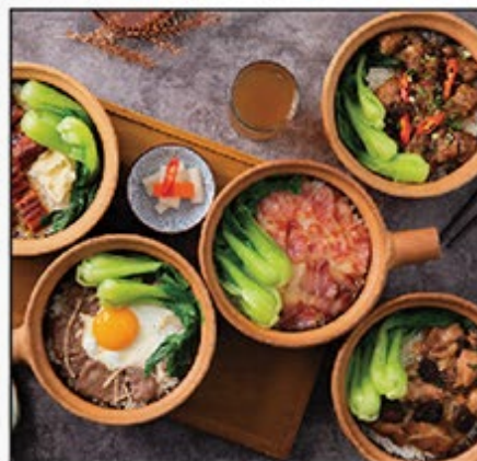
滋味煲仔飯及煲仔菜 Casserole Food Suggestion