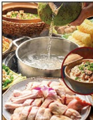
椰子椰雞窩配煲仔飯仔寶 Chicken Coconut Hot Pot with Casserole Rice