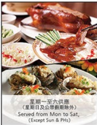
每晚一特好介紹 Special Dinner Recommendations