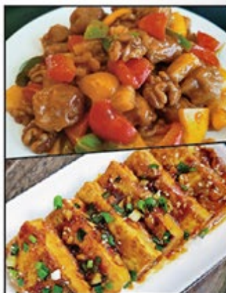
素食推廣 Vegetarian Recommendation Promotion