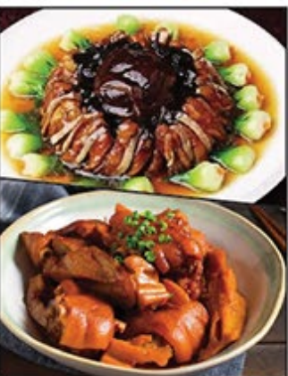
新春賀年菜式 Chinese New Year Special Dish