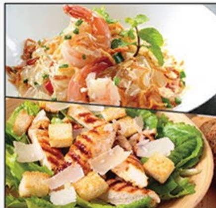
清新沙律 Fresh Salad

All Year Round Advance Order Menu 全年預訂供應