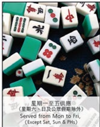
雀局推廣 Mahjong Entertainment