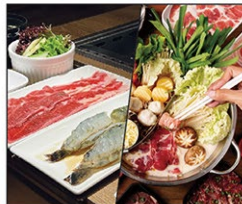
韓式燒肉及火鍋推廣 Korean BBQ and Hot Pot Promotion