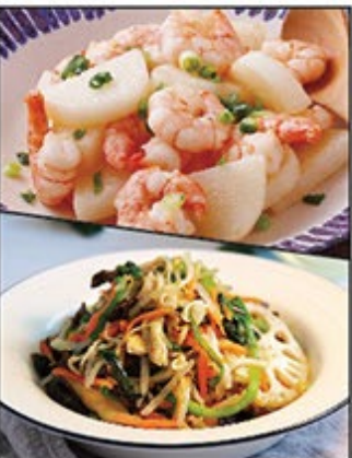
有營健康食譜 Healthy Food Promotion