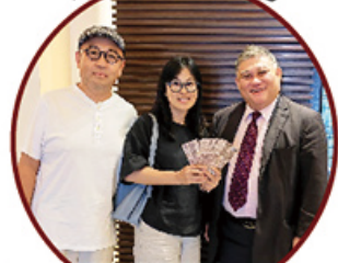
新入會會員「勁著數大抽獎」得獎者 (Apr to Sept 2023) New Member - winner of the "Super BARGAIN Grand Draw" (F&B coupon $10,000)