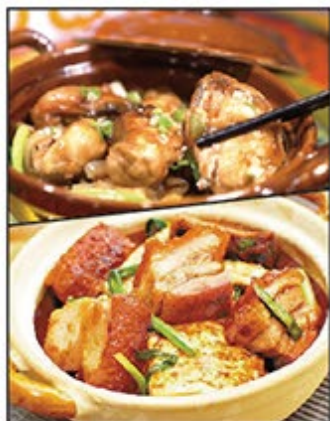
廚師窩燒推介 Hot Pot Delicacies