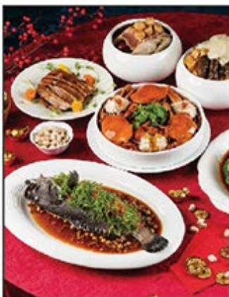
發財春茗菜譜 Spring Dinner Set Menu