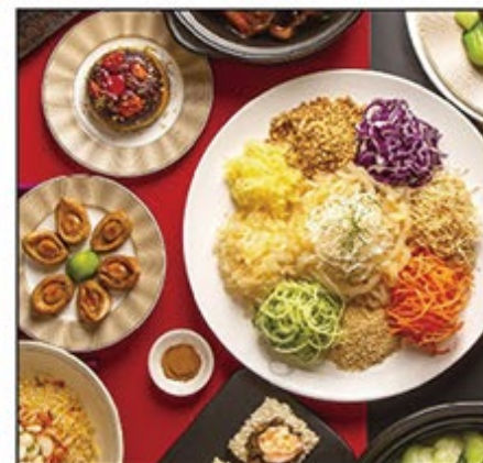
鮑你撈起 Shed Abalone Plate