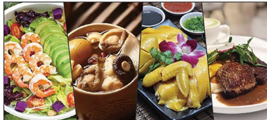
全新創意酒席 Banquet of New Culinary Innovation

All Year Round Advance Order Menu 全年預訂供應