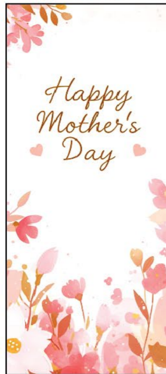
母親節特備菜式及套餐推介 Mother's Day Special Menu