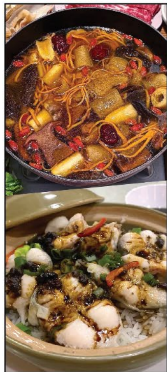
鮮野菌雞窩配煲仔飯仔寶 Fresh Wild Mushroom Chicken with Clay Pot Rice