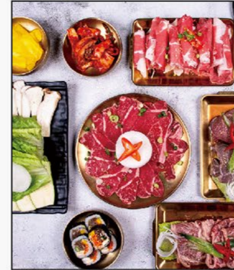
韓式燒烤放題 Korean BBQ All-You-Can-Eat