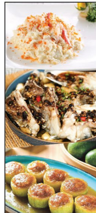
順德風味篇 Shunde Cuisine Delicacies