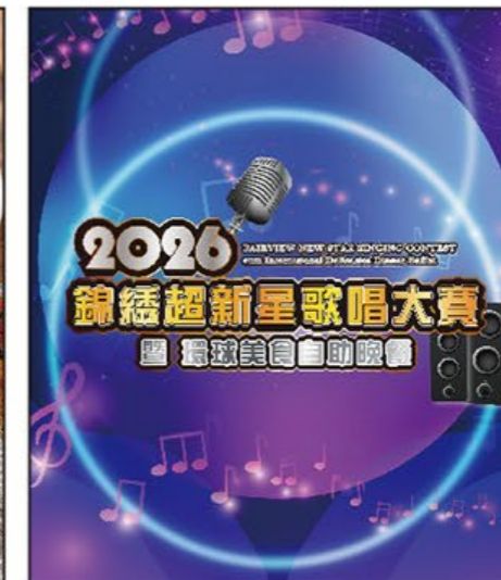
超新星歌唱比賽暨環球美食自助晚餐 New Star Singing Contest cum International Delicacies Dinner Buffet