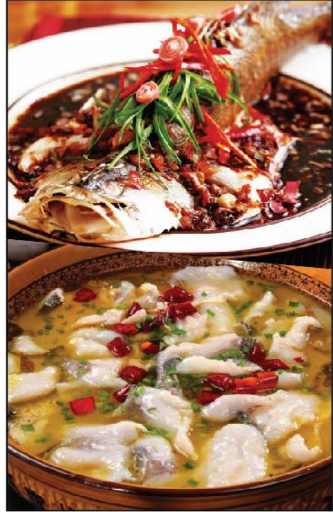
年年有魚 Fish Cuisine Delicacies