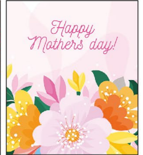
母親節自助晚餐 Mother's Day Dinner Buffet