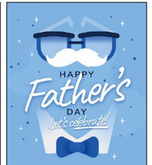
父親節半自助晚餐 Father's Day Semi-Buffer Dinner

查詢詳情，請致電：2482 8675 For details, please call : 2482 8675