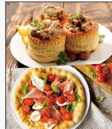
稱心滿“意” Italian Exquisite