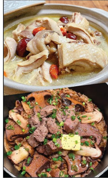
鮮胡椒豬肚雞窩配煲仔飯仔寶 Peppered Pork Tripe and Chicken Hot Pot with Clay Pot Rice