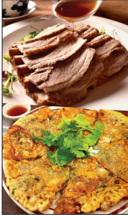
潮式美食坊 Chaozhou Delicacies Delight